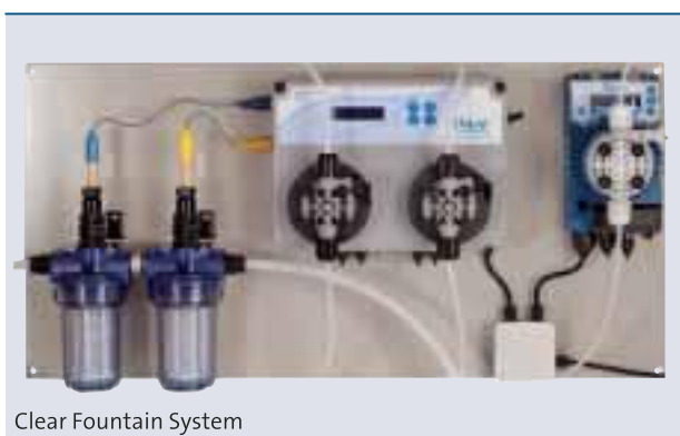
Clear Fountain System