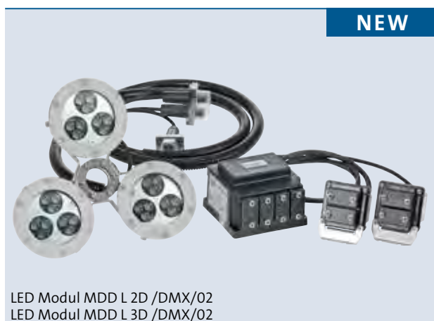
LED Modul MDD L 2D /DMX/02 LED Modul MDD L 3D /DMX/02

*In case of underwater application, an intelligent heat management and quality LED enables a lifetime of up to 100.000 hrs. This claim does not entitle to a guarantee.