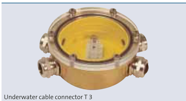
Underwater cable connector T 3

Cable connectors are connecting and separating elements for electrical consumers in all areas of water technology. Consumers can be conveniently connected and disconnected – and thanks to OASE – even without draining the water!