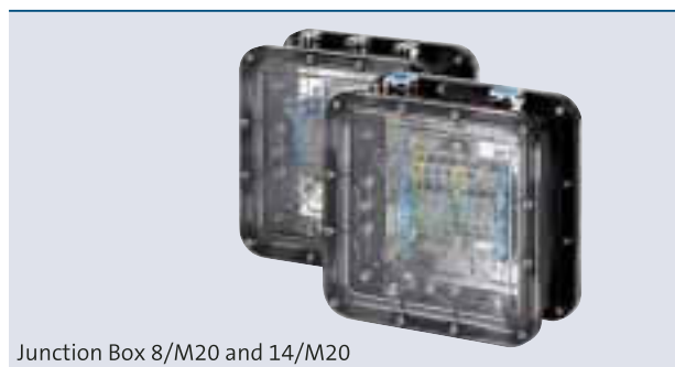
Junction Box 8/M20 and 14/M20